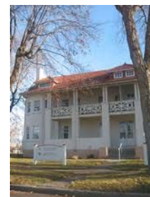
DEC headquarters in Missoula, MT

G oal 5: To re-organize DEC's Governance in order to create a more efficient structure that aligns with DEC's mission and can quickly respond to issues of interest to our members and can effectively position our organization for continued leadership. DEC activities related to this goal focused on engaging all 11 elected board members in discussing, planning, and implementing changes to current organizational structures. The formation of work groups and special interest groups was critical to ensure that the essential work of DEC was uninterrupted even with the ongoing changes in the board structure. In June 2011, the DEC board convened in Missoula, MT for a 2-day retreat to begin the process of adopting and transforming into a Policy Governance structure that will create a way for DEC to become a more efficient, relevant, productive, and responsive organization for its members and to the broader EI/ECSE field.