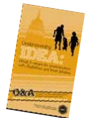
The IDEA book was launched in October 2010