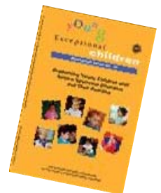
The 12 th YEC Monograph focused on Autism